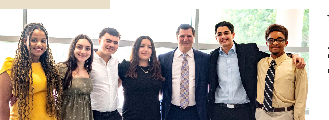
PwC Accounting Careers

Students graduating from reputable accounting programs are in high demand and have opportunities to immediately apply their knowledge in the workplace. Accounting firms, government offices, banks, financial institutions, law enforcement agencies, law firms, business intelligence firms, and tax authorities are a few examples of opportunities for accounting graduates. The average starting salary ranges from $50,000 to $65,000 in the New England area.