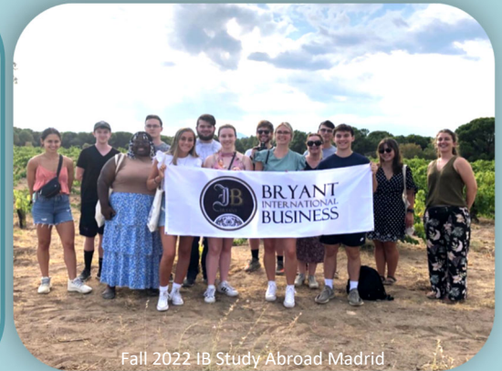
Fall 2022 IB Study Abroad Madrid